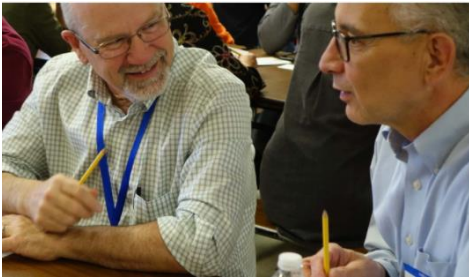
Meeting with community members during a charrette