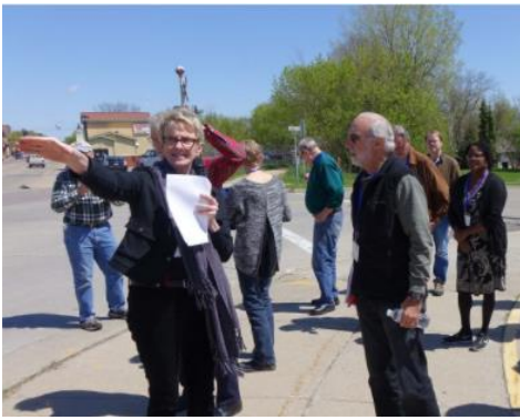
Touring the City of Reedsburg